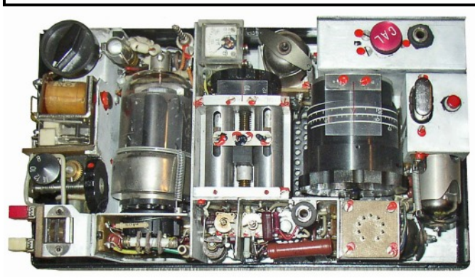
Top view of interior Sirius III transmitter unit.

Accessories: 'Měsic' Electronic keyer (magnetic tape for 250 groups), Merkur receiver, AC power unit, DC/DC convertor unit for 12V accumulator, crystals, Morse key, earpiece, power interconnect cables, aerial and earth wire.